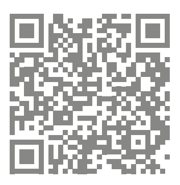
By the way: You can find these and other products on our website.