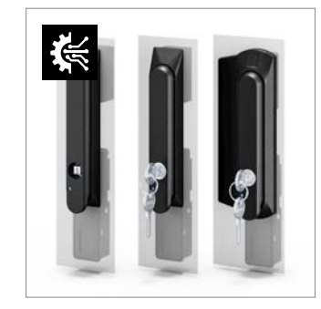
Mechatronic locking systems